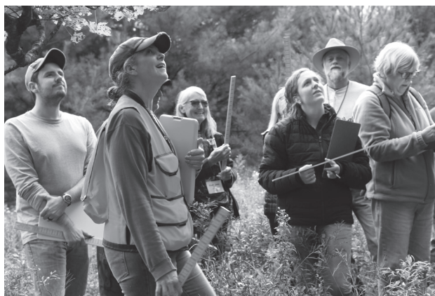
Above: The 29 members of the class of 2022 bring the total number of PA Forest Stewards trained since 1991 to nearly 800 volunteers across the state. Left: Participants receive a mix of hands-on field work and classroom training during their long weekend together.