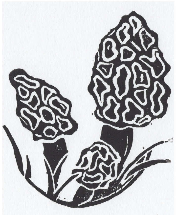
Hand-made chanterelle and morel art prints that are gifts for completing the mushroom hunter survey.